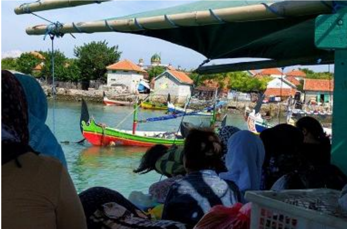
Figure 4.2. Traditional boat to Gili Mandangin, the only way to access the island.