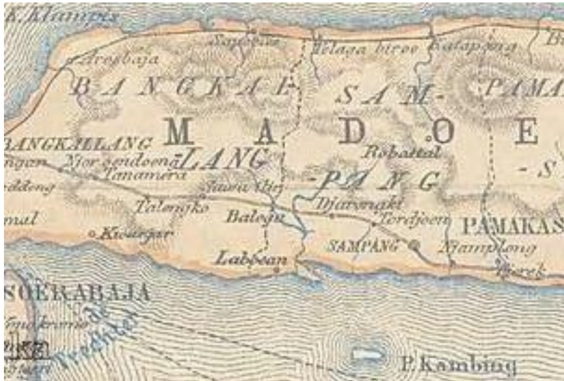
Figure 3.2. West Madura and Gili Mandangin (Pulau Kambing) in Jacob Kuyper's 1894 map

by a number of acts of resistance from local kingdoms in the Dutch East Indies, such as in Aceh, Bali, Batak, Lombok, and Madura that were threatened by the Dutch expansion into their regions (Ricklefs, 2001: 155-189).