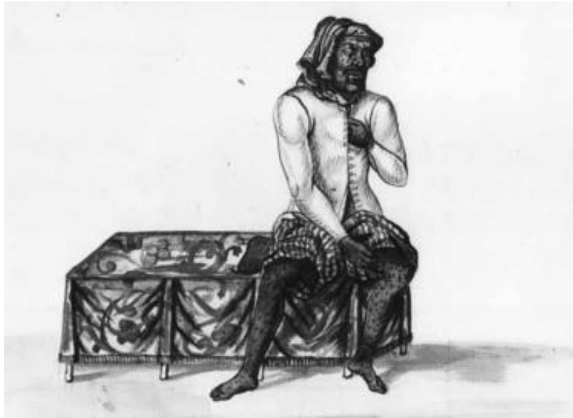
Figure 2.1. The King of Banggai, 1678, described by a Dutch traveler as blind and suffering from skin diseases like leprosy.