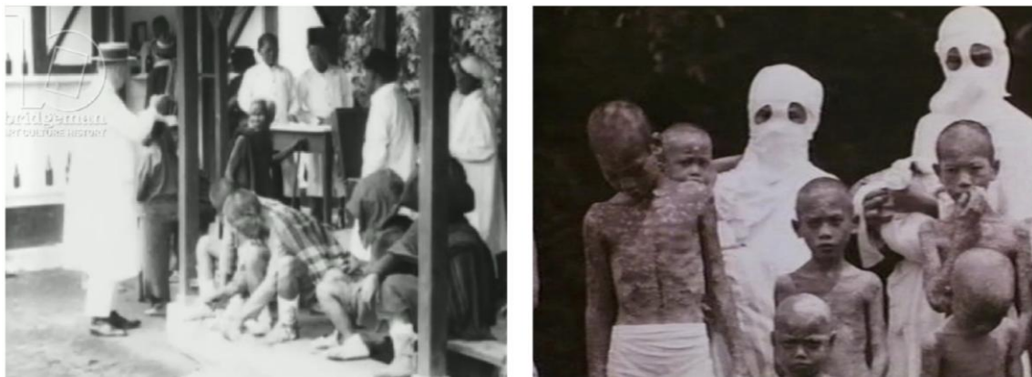
Figure 3.3. The life within leprosaria. Left picture is from an unknown documentary, a collection of Bridgeman Art Cultural History. The right picture is from a documentary movie about the Dutch East Indies entitled Mother Dao, The Turtlelike .

In the Dutch East Indies, the Dutch government took an instant decision to shift the function of Plantoengan Health Center from a military hospital to be the biggest leprosarium in Java. As a follow-up, the Dutch government officially announced a war on leprosy in the Dutch East Indies in 1907. After announcing the contagiousness of the disease, the Dutch government required all sufferers of leprosy—and also the sufferers of other skin and hideous diseases considered as leprosy—to be in compulsory isolation. 33 Until 1911, at least 20 leprosaria had been funded by the government in many areas in the Dutch East Indies, putting aside a number of leprosaria privately initiated by private missionary organizations or the locals.