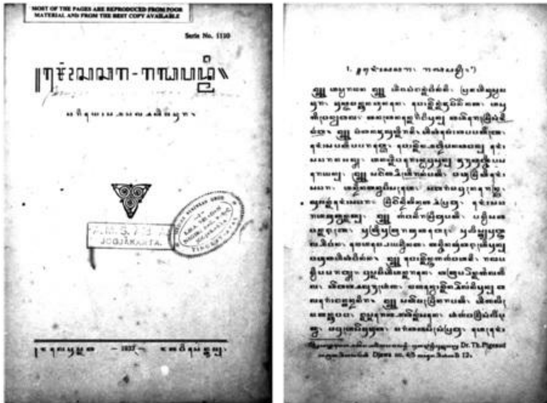
Figure 3.5. The cover and the first page of Bangsatjara – Ragapadmi, Carijos Asal Saking Madhura . The footnote states that it is a translated version of Pigeaud's Bangsatjara en Ragapadmi, Een Verhal van Madoera .

only four AMS or High Schools that were established in Jogjakarta in 1912, Bandung (1920), Surakarta (1926) and Malang (1927). The system was designed to prepare future Dutch-minded natives educators. Education was—and still is—considered as a soft and effective approach to shape natives mentality to support the ruler's interest. 42