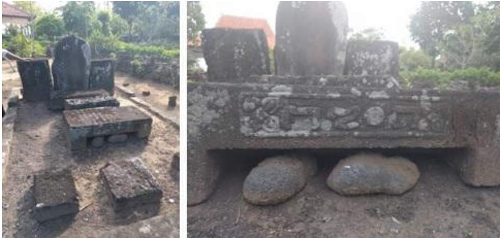
Figure 2.2. Lingga Bangsacara monument in Sampang

as Lingga Bangsacara . The monument, dated 1280 AD, is believed to be the evidence that Bangsacara, the husband of Ragapadmi, lived in the area before his death on the small neighboring island of Gili Mandangin.