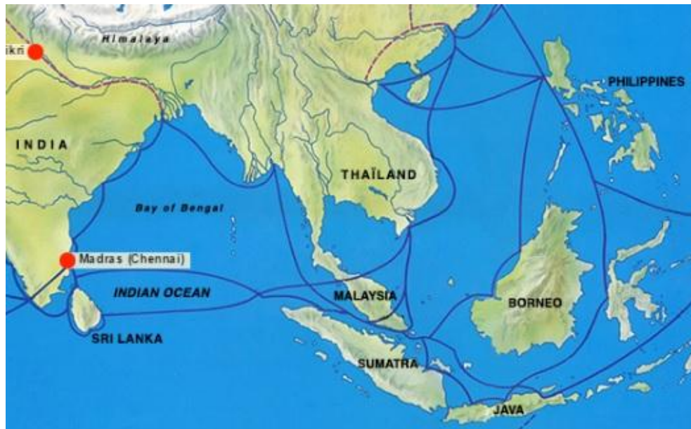
Figure 2.3. Maritime Silk Road to Insular Southeast Asia 25

Another travelogue also mentioned that during the maritime trade period from China to insular Southeast Asia the Madurese had direct and intense interaction with international traders due to their strategic location (see Figure 2.3). As early as the beginning of the 14 th century, a Chinese traveler, Wang Ta-Yuan wrote in his account that the Madurese were very strong and their jukung boat “has never been known to break up” (W. H. Scott, 1982: 340). Madura Island was also known for its prosperity among ancient travelers. As mentioned by Tome Pires during his visit to Java and Madura in 1512-1515, Madura: