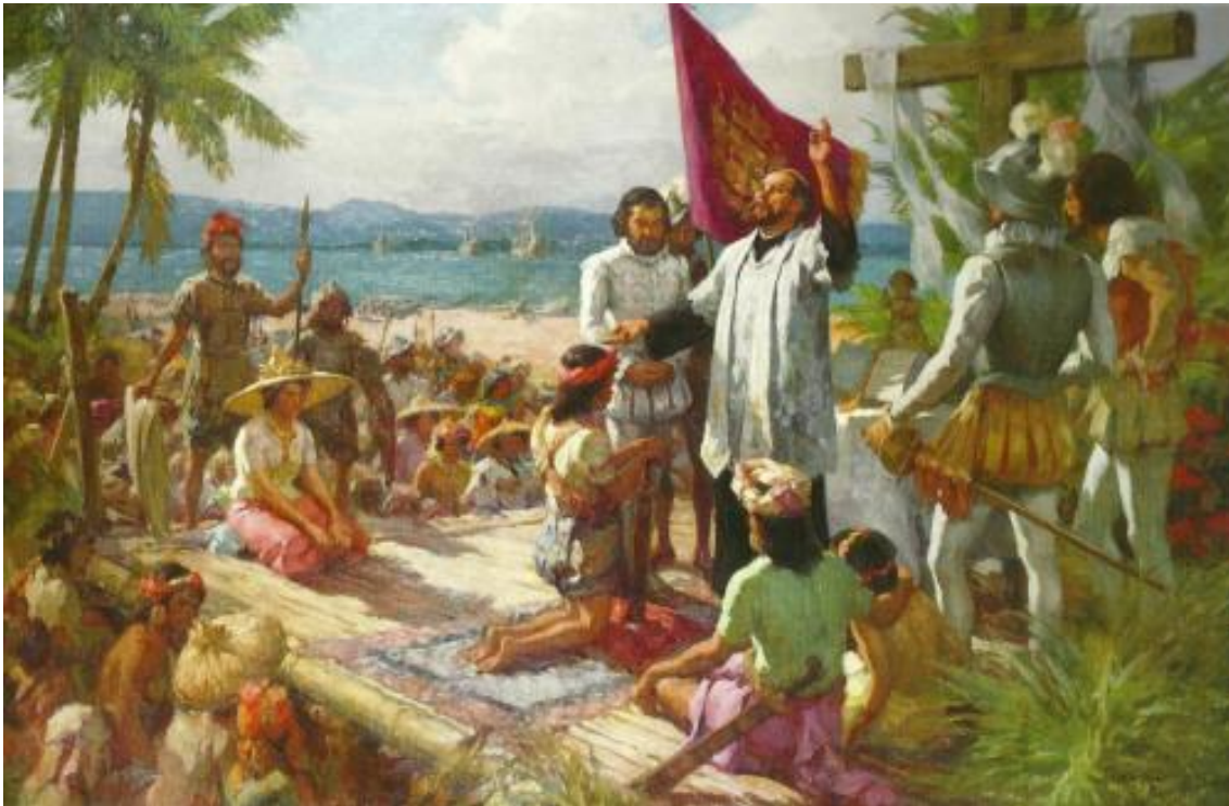
Figure 3.1. A painting about the baptism of Cebuano ruler and his wife on April 14, 1521, known as the first baptism in the Philippines. Painted by Fernando Amorsolo.