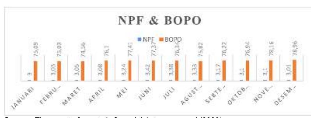
Figure 1. NPF & BOPO

In addition to facing risks, during the pandemic, Islamic banks are also required to carry out efficiency as an effort to reduce operational costs in the midst of the global and national economic downturn. The report from the Central Statistics Agency (BPS) in August 2020 stated that Indonesia's economic growth in the second guarter of 2020 was minus 5.32%. Previously, in the first quarter of 2020, BPS reported that Indonesia's economic growth only grew 2.97%, down far from growth of 5.02% in the same period in 2019. Efficiency in a bank is better known as Operating Expenses Income which measures the efficiency of the Bank's operations. BOPO is measured by comparing the amount of operating expenses to the income of the Bank. BOPO shows the efficiency of the Bank in carrying out its main business, namely the ratio between total costs and total revenue generated. The higher the BOPO ratio, the lower the level of operational efficiency of a bank. The higher the cost, the more inefficient the Bank becomes so that changes in operating profit are smaller (Aldiansyah, 2018). The lower the level of profit achieved due to inefficiency, the lower the profitability of a business entity. This is in line with the results of research conducted by Simatupang and Franzlay (2016), and Ariyani (2010) which showed that BOPO had a significant effect on profitability. The following is statistical data on the development of NPF and BOPO during 2020.