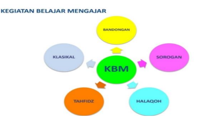
Figure 1: Learning Methods in SIBSEEP Teaching and Learning Activities

Based on the information above, two (2) understandings can be drawn that, first, learning activities at SIBSEEP are carried out through a combination of traditional learning methods such as sorogan, bandongan, halaqoh, and tahfidz with general learning methods used in schools such as classical methods. This is in accordance with the guidelines issued by the Ministry of Religion in the following figure: